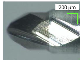
Tool damage after milling 10 hr

Milling shape : Reflector mold Finishing tool : 2-Flute Super Finishing Long Neck Ball End Mill CBN-LBSF R0.4 x L2 (Not a standard product) Work material: STAVAX (52HRC) Work size : 35 x 35 x 50 mm Coolant : Air blow (Oil mist in the finishing)